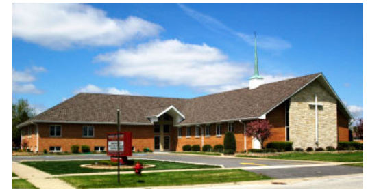
Wesleyan Community Church